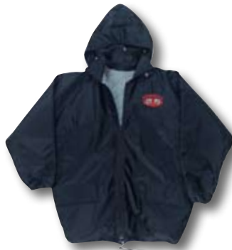
DOW 001 Oversized Sideline page 6