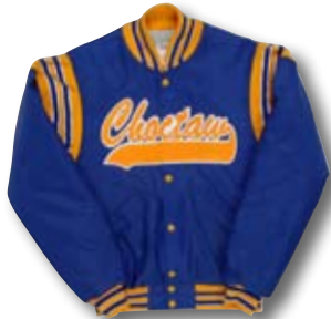
DOW 033 Knit Shoulder Insert page 3