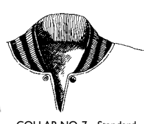
COLLAR NO. 7 - Standard knit. "Stand-up" collar. 100% stretch nylon for color fastness and memory retention.