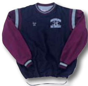
DVP 013 Knit Shoulder Insert page 5