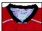
FLAT V with V-3 Strip