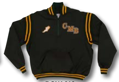
DOW 012 Knit Shoulder Insert page 4