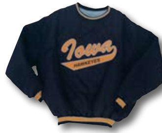
DVP 014 Set-In Sleeves page 5