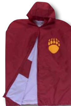
43283 Sideline Cape page 6