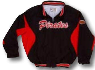
DOW 300 Matching Sleeves page 2