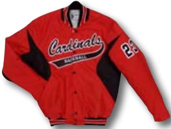
DOW 300 Matching Sleeves page 2