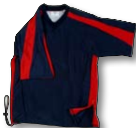
DVP 168 Batting practice page 5