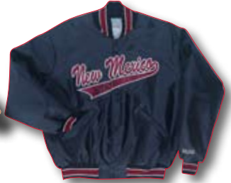
DOW 031 Set-In Sleeves page 3