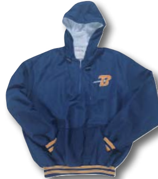
DOW 010 Set-In Sleeves page 4