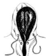
COLLAR H - Hood.