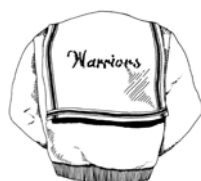
COLLAR NO. 1 - Sailor collar. "Upside color" is side showing and "downside color" is underneath. No zipper.