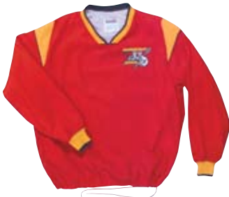
DVP 174 Shoulder Insert