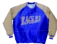
OPEN HEM DRAWCORD