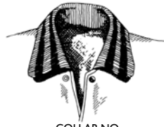
COLLAR NO. 8 - Hug knit or "byron-knit" collar. 100% stretch nylon for memory retention.