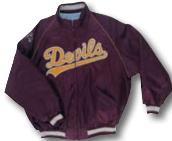
DOW 041 Raglan Sleeves page 3