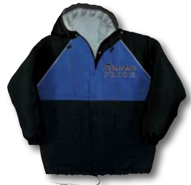
DOW 341 Parka page 6