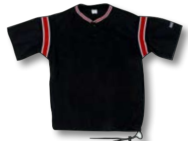
DOW 038 Set-In Sleeves page 5