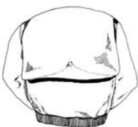
COLLAR NO. 3 - Sailor collar. "Upside color" is side showing and "downside color" is underneath. Hidden zipper on "downside" to form the hood.