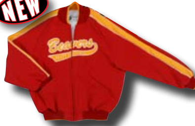
DOW 841 Raglan Sleeve Insert page 2