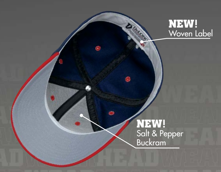
NEW! on Custom Quick and Custom Caps